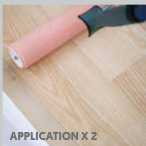
APPLICATION X 2